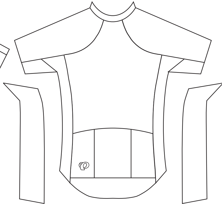
Left Side Panel